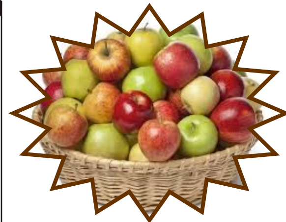
An apple a day keeps the doctor away!

BBQ on Bun Cheesy Breadsticks with Marinara Sauce Oven Fries Baked Beans Tossed Salad